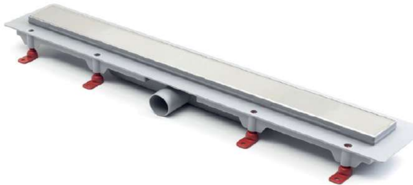
KLASIK - (reversible)